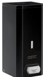
DJ0031B Matte black epoxy finish