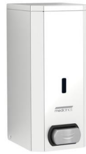
DJ0031C Bright finish