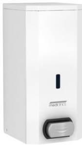
DJ0031 White epoxy finish