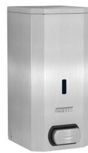
DJ0031CS Satin finish