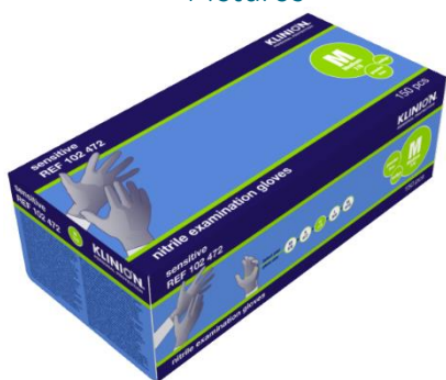
Ref. product 102472