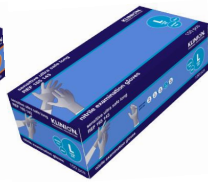
Ref. product 165143