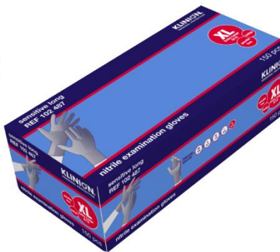
Ref. product 102487