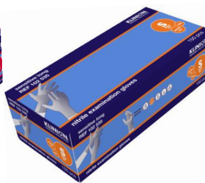
Ref. product 102535