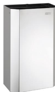
PPA4279C Bright finish