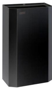
PPA4279B Matte black finish