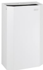
PPA4279 White finish