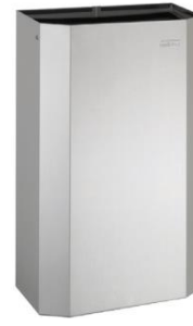
PPA4279CS Satin finish