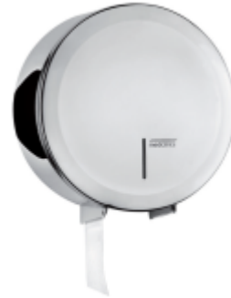
PR2787C Bright finish