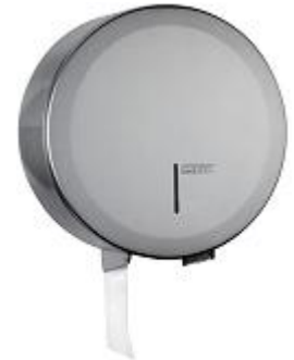
PR2787CS Satin finish