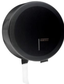
PR2787B Black epoxy finish