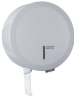
PR2787 White epoxy finish