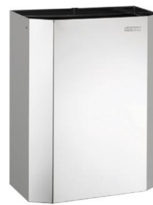
PPA2279CS Satin finish