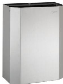
PPA2279C Bright finish