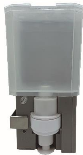
DJM0037A Satin finish body