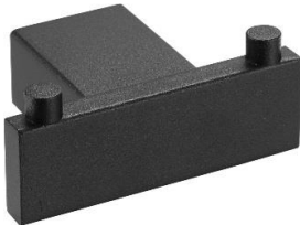
AI2418B Black finish