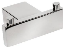
AI2418C Bright finish