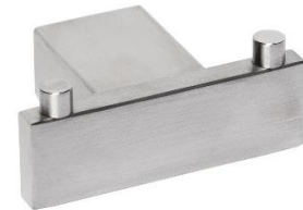
AI2418CS Satin finish