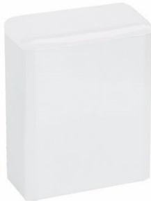
PP0006 White finish