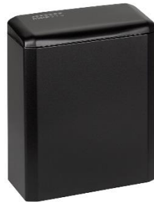
PP0006B Matte black finish