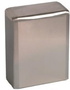
PP0006CS Satin finish