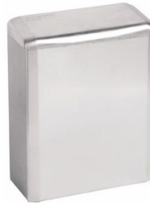
PP0006C Bright finish