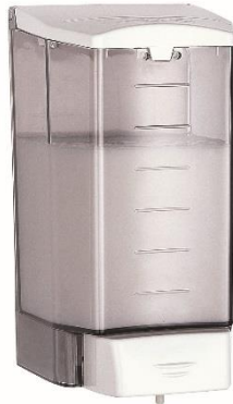
DJ00010F Bright finish