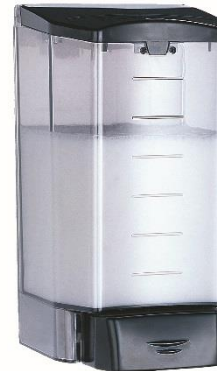
DJ0020F Satin finish