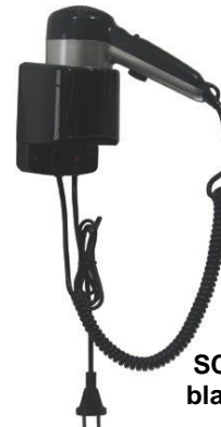
SC0020CS black finish