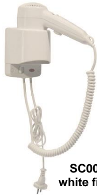
SC0020 white finish