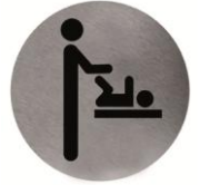
PS0005CS Satin finish