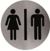
PS0001CS Satin finish