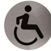
PS0004CS Satin finish