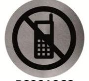
PS0010CS Satin finish