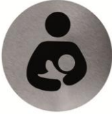
PS0006CS Satin finish