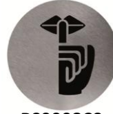
PS0008CS Satin finish