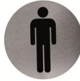
PS0003CS Satin finish