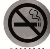
PS0009CS Satin finish