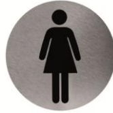
PS0002CS Satin finish