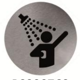
PS0007CS Satin finish