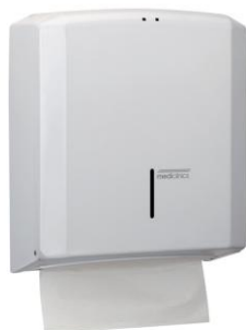
DT2106 White epoxy finish