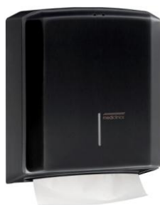
DT2106B Black epoxy finish