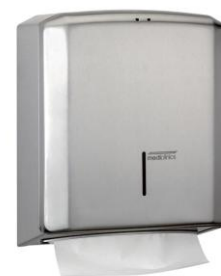
DT2106CS Satin finish