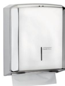
DT2106C Bright finish